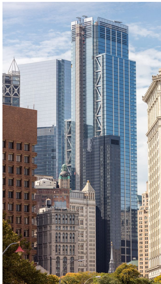
3 World Trade Center