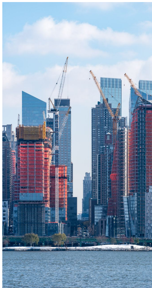
Waterline Square | Field Condition

platform over the west rail yards will begin to be installed in 2018.