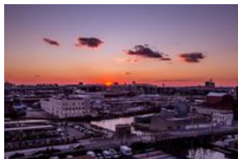
The proposed rezoning of Gowanus will take steps forward in 2018.

The proposal has won the approval of the various Bronx community boards it will affect (4, 5, and 7), along with the approval of Bronx Borough President Ruben Diaz Jr, with some stipulations . The rezoning is now in the public review phase, with the City Planning Commission (CPC) expected to vote on—and likely approve—the measure in January, paving the way for full City Council approval.